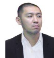
Miyake, Ichido Computer IT Consultancy Spouse: Princess